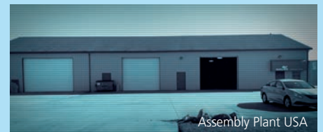
Assembly Plant USA

MobyDick Dust Control offers a wide selection of modern cannons for dust control. Based on detailed analysis, FRUTIGER also produces customized complete solutions for applications in indoor and outdoor areas. Typical areas of application include construction sites, materials handling sites, recycling yards, quarries, mines, steel and cement factories.