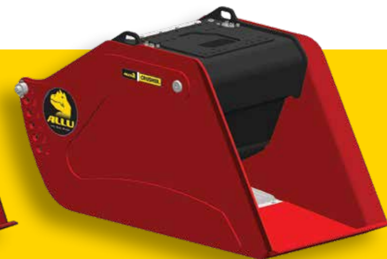
AC 25 - 37