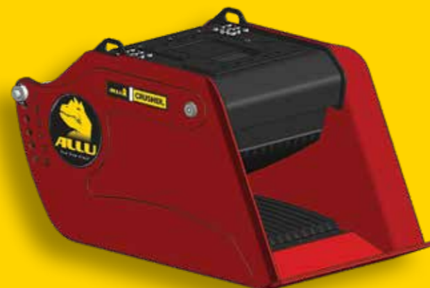
AC 10 - 16