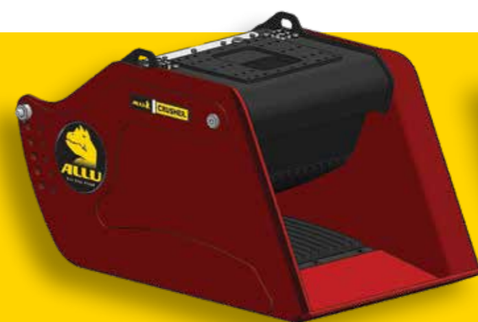
AC 20 - 22